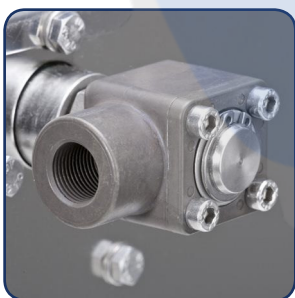
Angled swivel WDTH12/Al