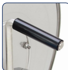
Hand crank with polyamide roll