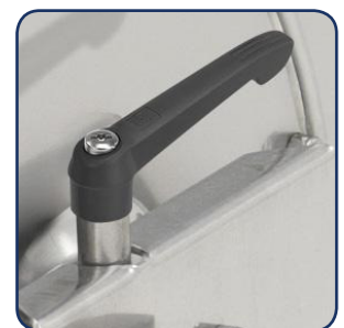
Brake handle black or blue available